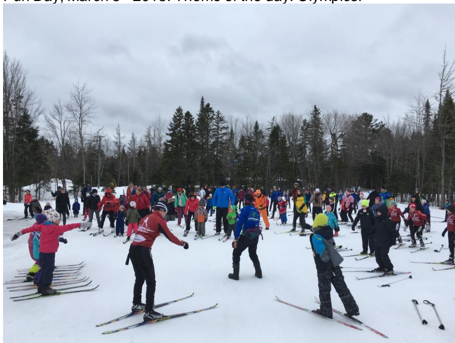
Group warm up!

Fun Day, March 3 th 2018. Theme of the day: Olympics!