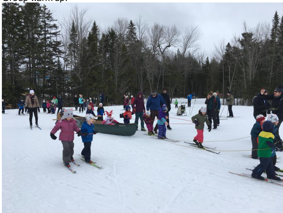
The bunnies pulling a canoe!